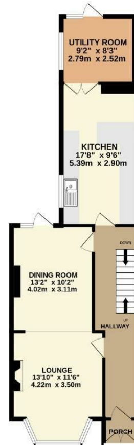
GROUND FLOOR 655 sq.ft. (60.9 sq.m.) approx.